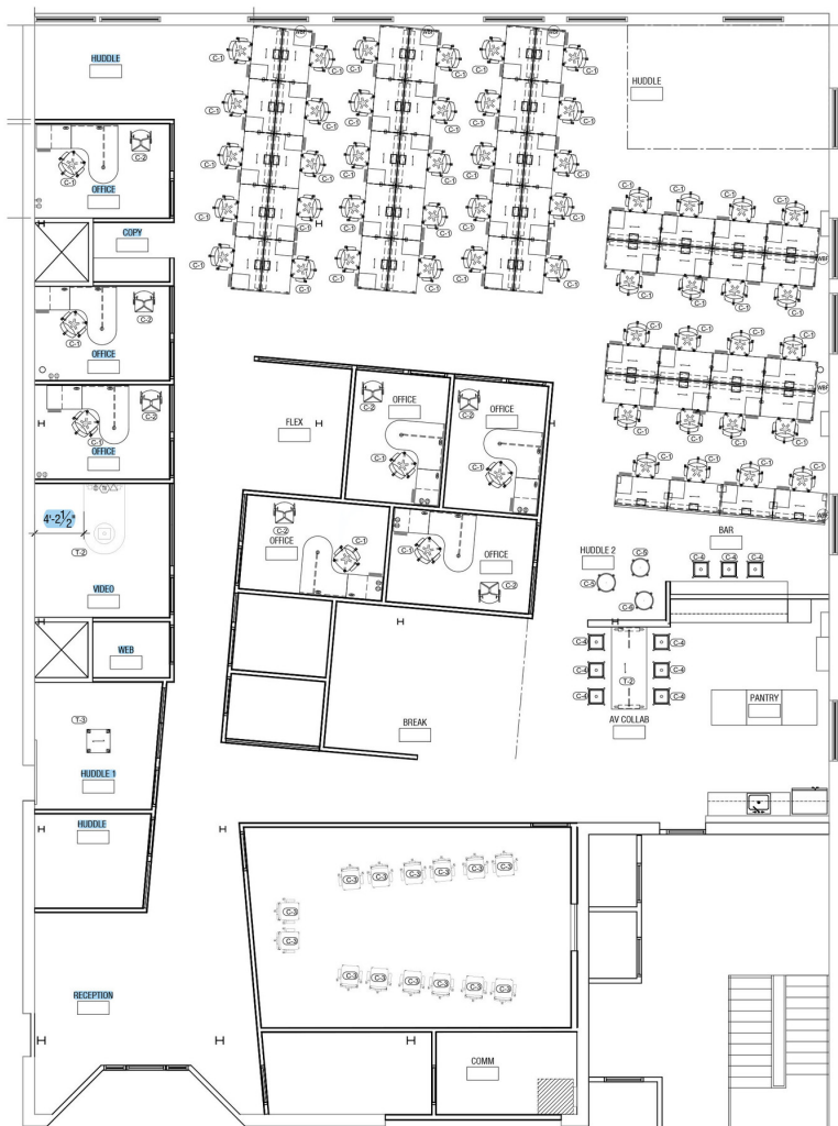
Suite 304 | 6,800 SF